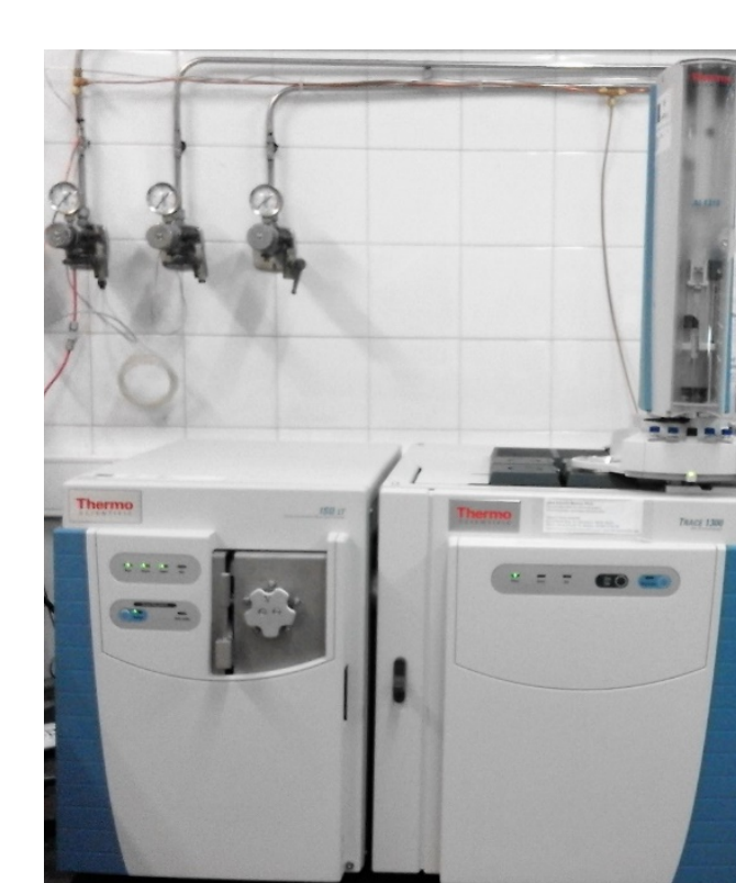
Figure 2. GC-MS.